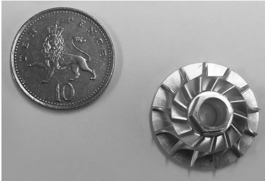
Figure 1 Prototype radial inflow turbine rotor