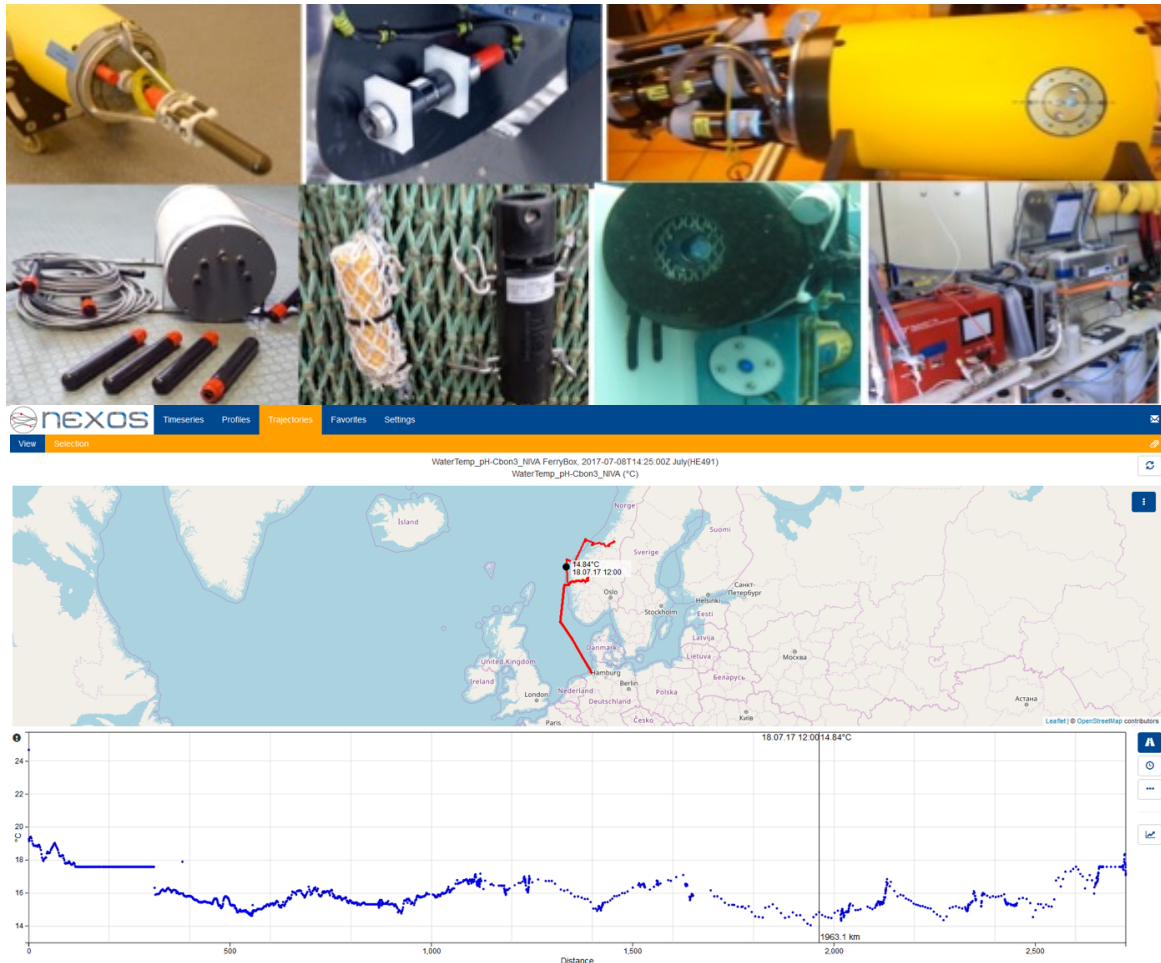
Figure 3: NeXOS developments