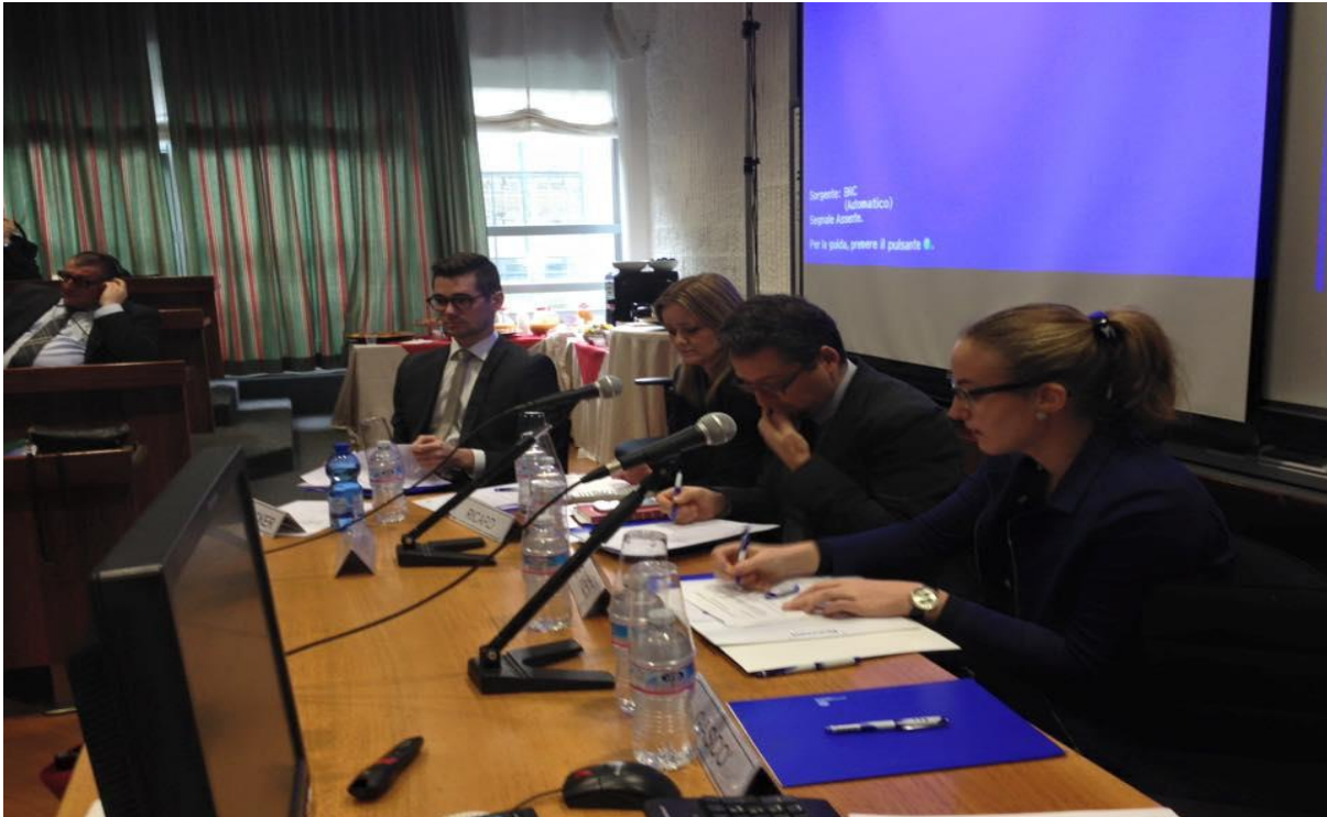
Round table with the involved researchers from the different countries.