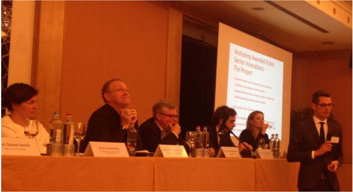
Panel of the LIPSE work package leaders on the main results of the LIPSE project.