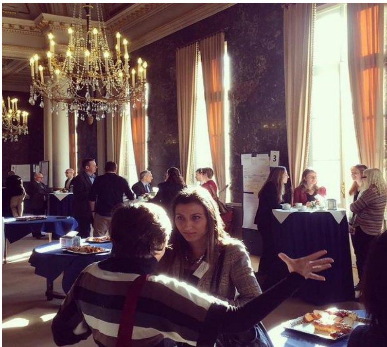
Interactive workshops at the LIPSE midterm conference.