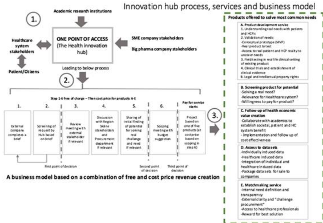
Figure 2. Innovation hub business model, process and services/products offered to serve most common needs.

more efficient and they have international collaboration that support research, development and uptake of digital healthcare solutions.