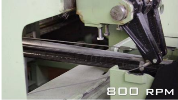
Figure 1 - Push rod on a Selcom machine (frontal)