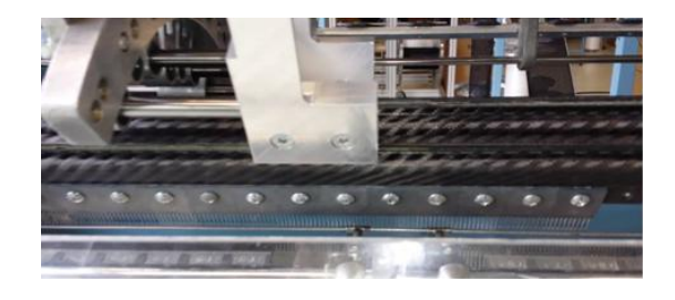
Figure 2 - Pattern bar and stem parts on Alge machine (frontal)