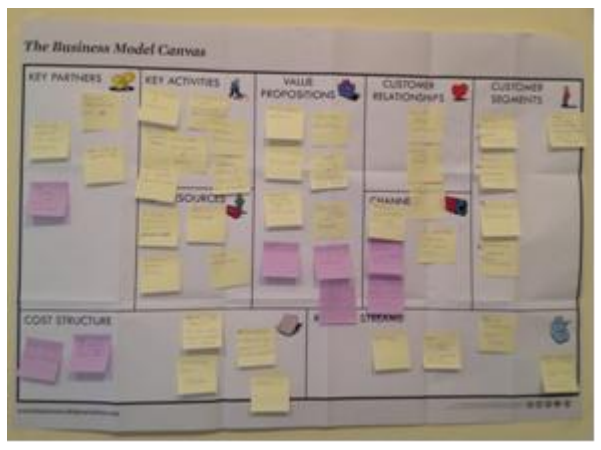
Figure 5: MACH-to Business Model

All the specific actions that the project partners will take to maximise the exploitation of the project results have been defined in cooperation with the whole consortium during an Exploitation Strategy Workshop organized ad hoc.