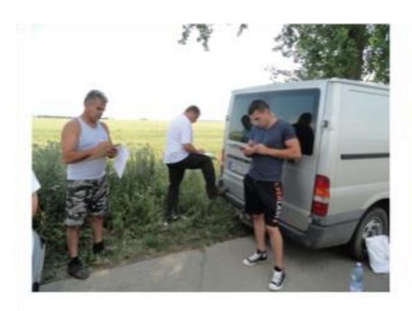
Farmers were asked to fill in pre-training test (post training tests will also be done)