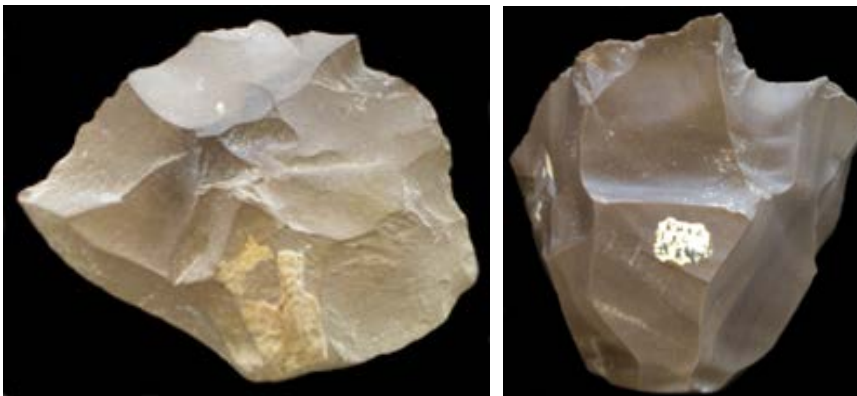
Oldowan stone tools