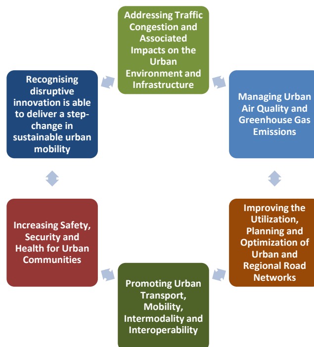
Figure 1. THE ISSUE's "Model Programme (2014-2020): A Roadmap for RDT Traffic, Health and Environmental Applications in Urban and Regional Economies Across Europe"

Implementing this roadmap will offer urban and transport planners new, innovative, viable, evidence-based and sustainable solutions to tackle many operational transport and urban mobility challenges impacting on the economies, environment and health of citizens in cities and regions across Europe.