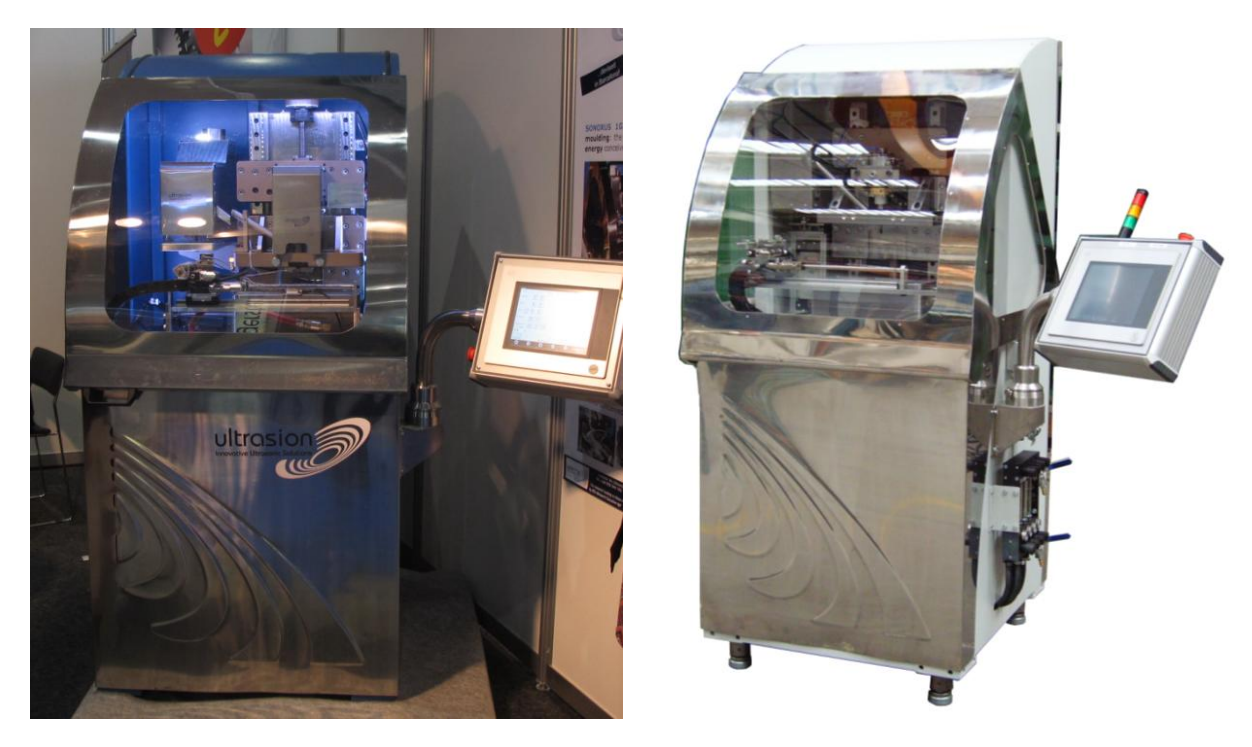
Final SONO"R"US MACHINE (SONORUS 1G)