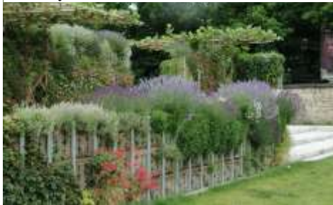
Figure 5 Green Living Room, Ludwigsburg, Germany

local sustainability events. Helix is planning an even larger tour in 2017 and the first dates are already confirmed. There is also interest from cities to buy several of the Mobile Green Livingrooms as the 'mascot' for their own urban green infrastructure activities and to make them more visible on city markets and squares. More information can be seen in this video , and in visiting the popular Mobile Green Living Room Facebook page that accompanied the tour, as well as here . As a result of their innovation activities, Helix is now a partner on the 'innovating cities through nature-based solutions' Horizon 2020