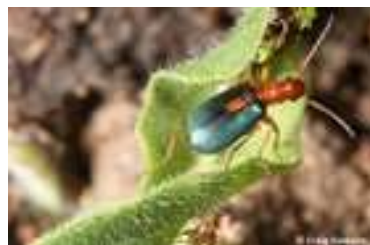
Figure 2 Extinct Streaked Bombardier Beetle rehomed on UEL Beetle Bump