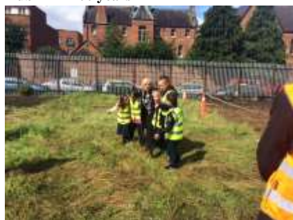
Figure 3 Communities co-design first neighbourhood park in the Liberties area of Dublin in 100 years

Work package 3 had as its goal the aim of developing transition strategies and scenarios to enable cities to improve planning. To address urban industrial regeneration challenges requires the incorporation of creative design. There is a large amount of information, much of it hidden away in reports and old documents, so much of the operation of the work package was devoted to building research capacity among the partners. It has also carefully selected differing sites and urban issues, necessitating numerous visits and communications with sometimes difficult to access urban authorities. The extensive and comprehensive literature review yielded information necessary for the integration of resilience into mainstream planning and design. Many similarities between cities were