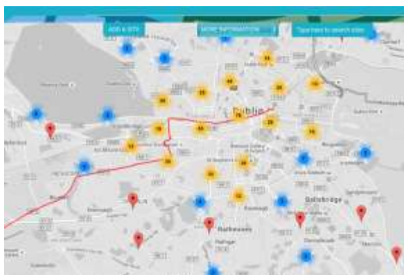
Figure 1 Space Engagers online tool for mapping underused space, now being used by leading homeless charity in Dublin

within the TURAS cities and urban regions. This new interface was a key functioning part of the TURAS project website, and was accessible to the public for testing and validation on an ongoing basis. The web-based G-ICT tool was linked to the local authorities' websites in those cities or urban regions and was developed in close cooperation with the other TURAS work packages, based on their local case study context and methodological approaches. This work package was divided into two stages. Stage 1 was the development of a WebGIS database with general as well as specific case study data. Stage 2 was the provision of tools to support much better community engagement. This resulted in a live WebGIS for most of the TURAS case study cities as well as an interactive 'geowiki', where the public and urban communities were invited to upload their own information. The work package 1 research team, together with Future Analytics and the University of Taichung with SkyEyes (both in Taiwan), worked with other work packages to further develop these tools. These include a crowd-sourced web mapping application for vacant sites, a 'geotimeline' for community capacity and a Twitter geospatial analytics dashboard for green infrastructure. A final output was the 'Resilience Dashboard'; a multifunctional dashboard where the tools and data are integrated to support smart resilience planning and decision-making. This work package produced two deliverables ( 1.1 and 1.2 ).