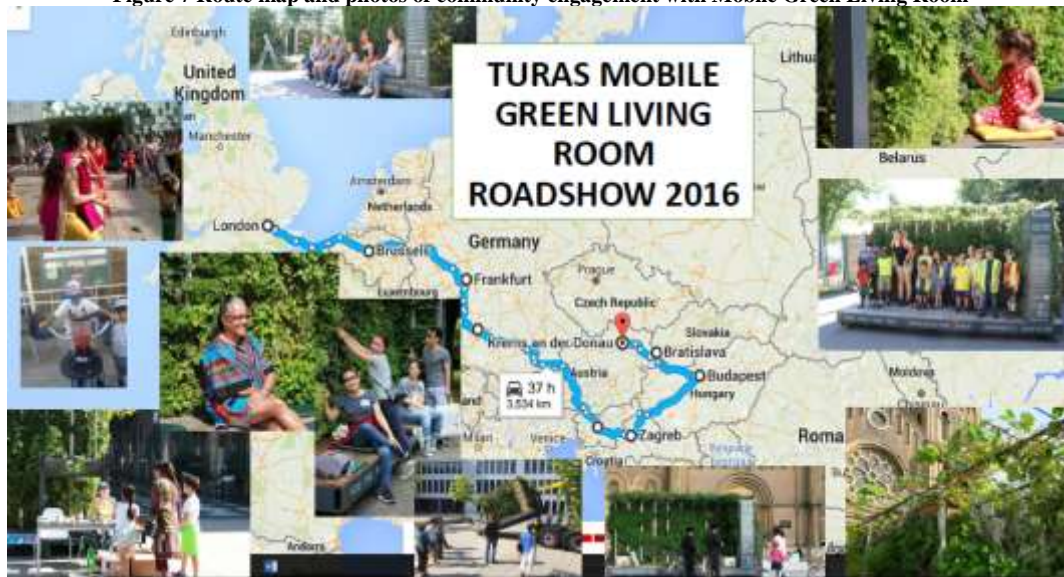
Figure 7 Route map and photos of community engagement with Mobile Green Living Room

In the final months of the project, WP7 and WP8 partners collaborated closely on the design and implementation of a web interface presenting the 83 project outcomes (Integrated Transition Strategies, tools, Place based strategies and pilots) in a user-friendly format for uptake and exploitation by non-partner cities. These project results are highly visible on the home page of the TURAS website which has been revised into a static website format to be maintained for at least 2 years after the project ends. Work is ongoing to transition the 83 TURAS outcomes to the Oppla marketplace and case study database to ensure the ongoing sustainability and exploitation of project outcomes.