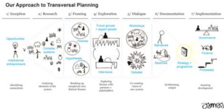
Osmos infographic on their transversal planning methodology.