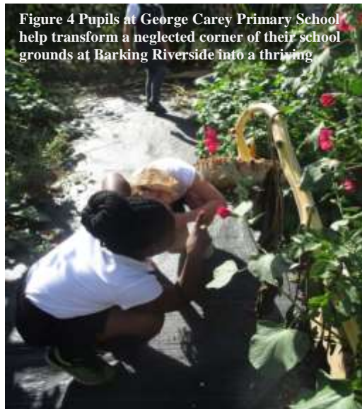
Figure 4 Pupils at George Carey Primary School help transform a neglected corner of their school grounds at Barking Riverside into a thriving

TURAS has created a decision-maker toolkit for assisting in transitioning in city-making. This toolkit is located on the main website, which has now been adapted (in its legacy format) to be a one-stop show for all stakeholders. There are four locations, each 'tagged' with key words to interface with the other three. The first location consists of integrated transition strategies . This is a step-by-