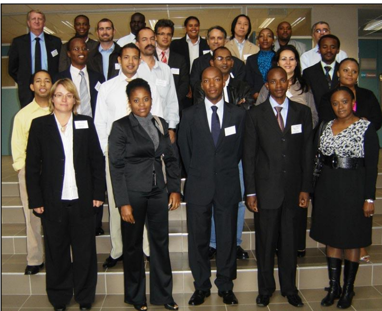
Presenters and participants at the AeroAfrica-EU Promoting African and European Research Cooperation in Aeronautics and Air Transport Workshop, held in April 2011 in Johannesburg, South Africa

The AeroAfrica-EU Promoting African and European Research Cooperation in Aeronautics and Air Transport Workshop, held in April 2011 in Johannesburg, South Africa, provided a platform for African aeronautics and air transport researchers to share their research work. The African representatives, from Egypt, Kenya, Tunisia, Uganda, and South Africa, were also introduced to the Framework Programme and the potential for R&D collaboration between Africa and the EU in the areas of aeronautics and air transport. Opportunities for participation in the July 2011 FP7 Aeronautics and Air Transport call were emphasised.