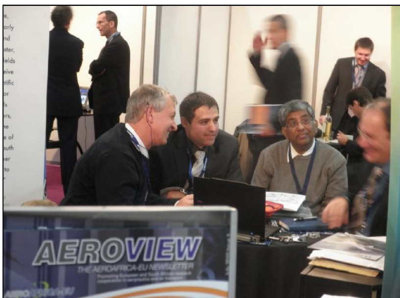
Networking at the AeroAfrica-EU exhibit at Aeromart International Business Convention, Toulouse, France in November 2010