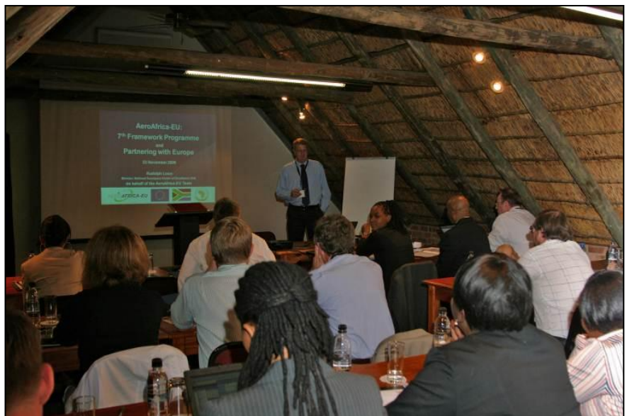
Presentation at IASSA “Aerospace Technology – enhancing our partnerships” session