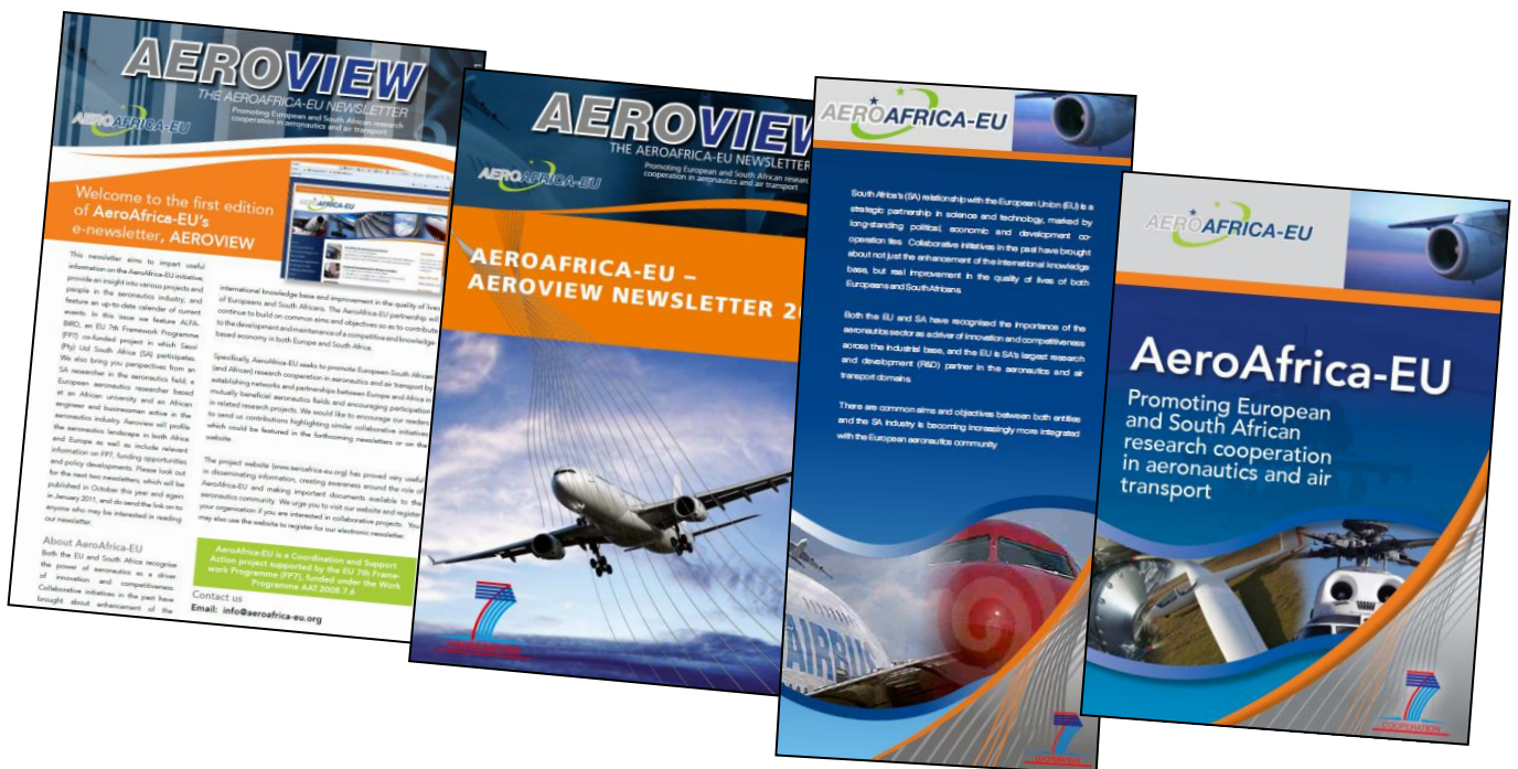
Project brochures and newsletters

Regular contact and information sharing was maintained with the AeroAfrica-EU community (circulation list in excess of 600 subscribers) through e-mail communiqués.