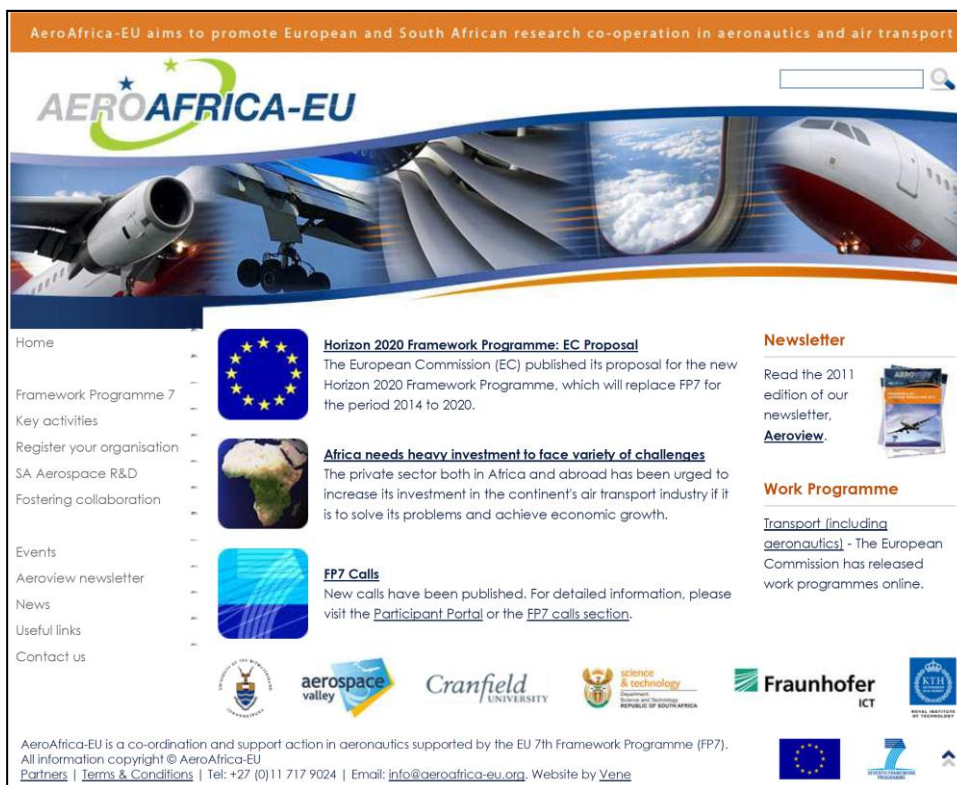
Snapshot of www.aeroafrica-eu.org

In support of the project activities, the project website www.aeroafrica-eu.org was successfully developed and launched in May 2009.