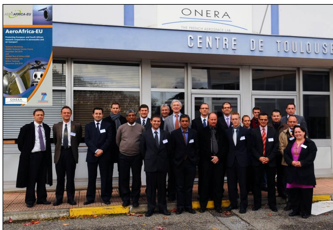
Attendees of the Technical Workshop, hosted at the ONERA Centre in Toulouse, France in December 2010

The Promoting European and South African Research Cooperation in Aeronautics and Air Transport Technical Workshop, hosted at the ONERA Toulouse Centre in France in December 2010, was aimed at identifying areas/topics in aeronautics and air transport for mutual collaboration – for the 4 th and 5 th FP7 calls, looking forward to Horizon 2020, and potential bilateral cooperation initiatives that could springboard into FP involvement. Two technical sessions were hosted: aircraft design and tools and aero-structures and production. A demonstration of Design Software tool CEASIOM software and a technical visit of the Airbus A380 final assembly line also formed part of the programme.