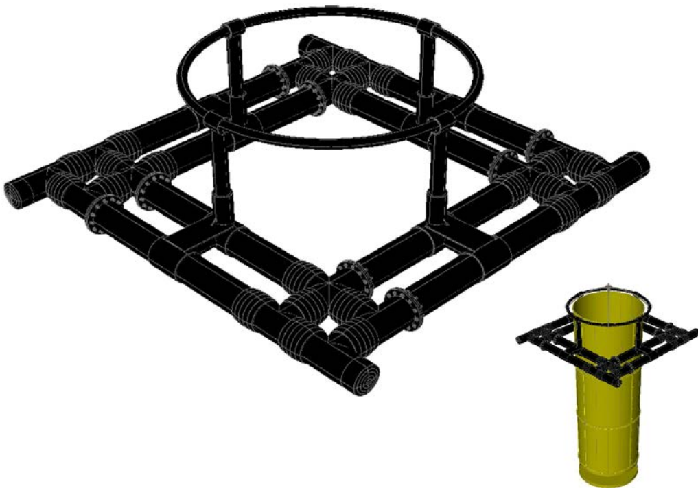
Figure 4. 3-D view of an individual LAMP structure. The insert shows 3-D view of the structure with a mesocosm bag.