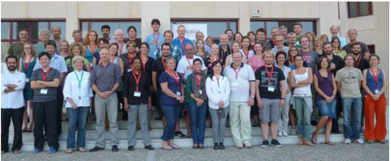
Figure 6. Participants to the MESOAQUA final symposium. HCMR, Crete, October 2012.