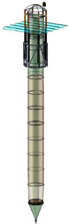
Figure 2. Sketch of a KOSMOS single mesocosm unit.