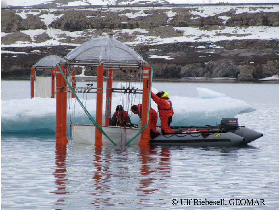
Figure 3. KOSMOS in Ny-Ålesund.