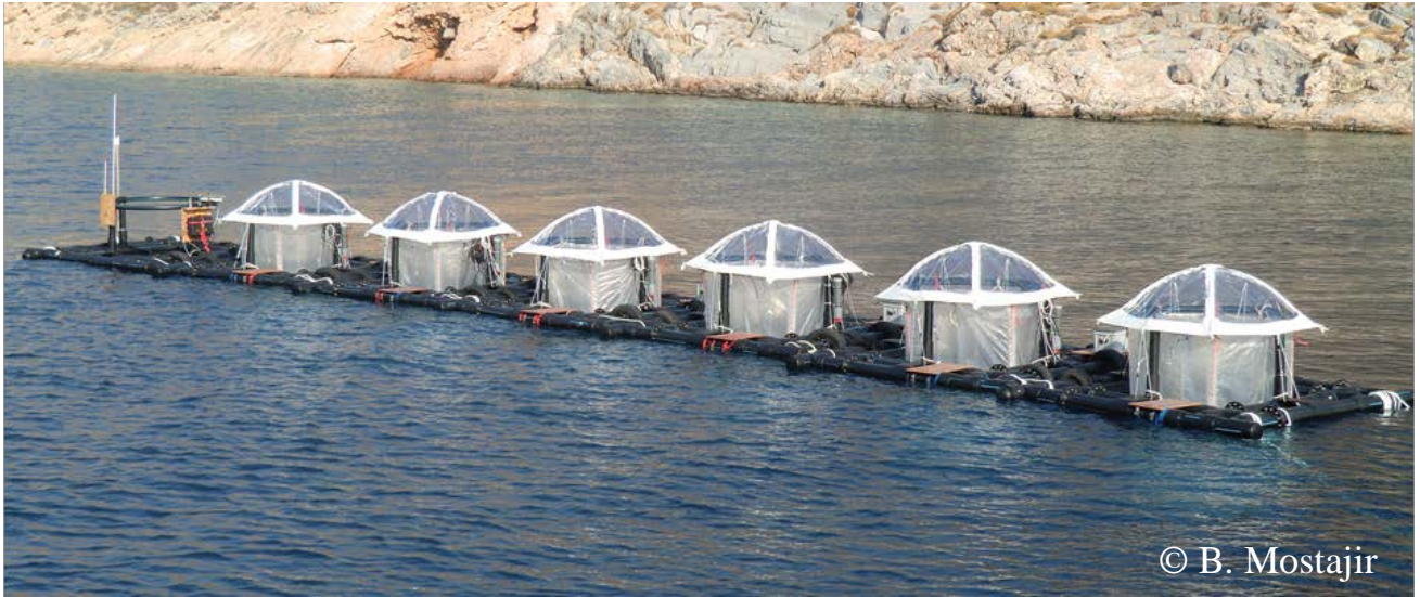
Figure 5. LAMP final test in Dia Island, Crete. September 2011.