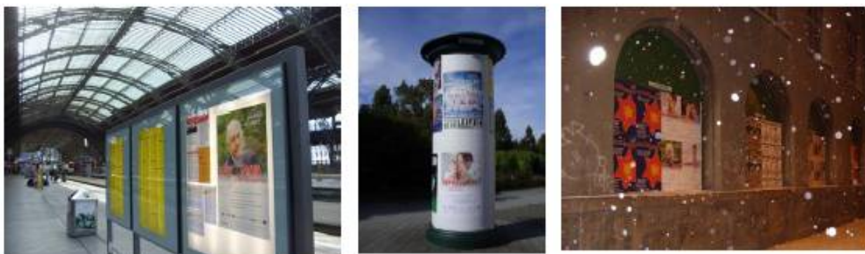
Figure 6 Examples from the public awareness campaign (poster presentation)

The opening ceremony was held in June 2009 in the Gewandhaus Leipzig (concert hall) with approx. 250 participants. During the project, 175.200 flyers were distributed. Further, 625 large poster were displayed in public areas and 1950 small posters were displayed in public transportation, university environment, public health institutions. Additional medium size posters were displayed in the public area, e.g. on train platforms (figure 6) or local restaurants. A press conference and additional 45 public informational events were held. A cinema spot was broadcasted regularly between March 2010 and March 2011. A local website with information about the LAaD, current events, addresses of support and consulting and a selection of regional press releases in review was launched and is accessible on www.buendnis-depression.de/leipzig .