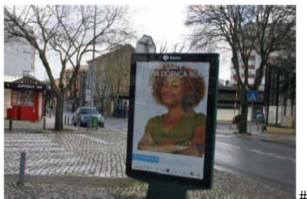
Figure 5 Mupi on Amadora main street

OSPI-Amadora appeared in the main newspapers in the intervention region as well as in national radio stations.