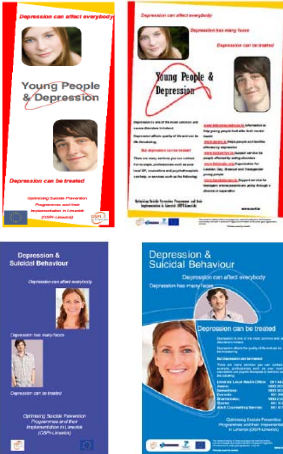
Figure 7 Adolescent and adult materials in Limerick