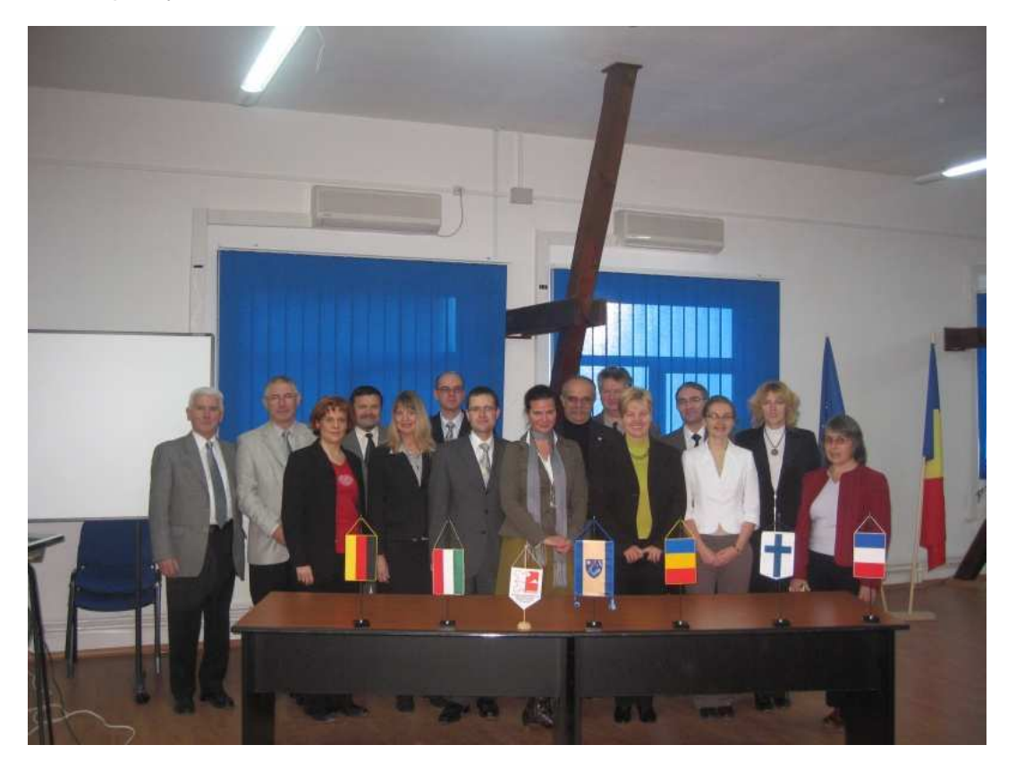
Project consortium at the Launching Conference in Covasna (Romania), December 2008

Beside the economic effects that an established wood cluster could have for the region Brasov-Covasna the cluster shall support the integration of the region into the European Research Area. Eight partners from Romania, Finland, France and Germany have formed a consortium. This partnership comprised the needed stakeholders on the Romanian side and the knowledge about cluster policy tools, wood research and business on the other side.