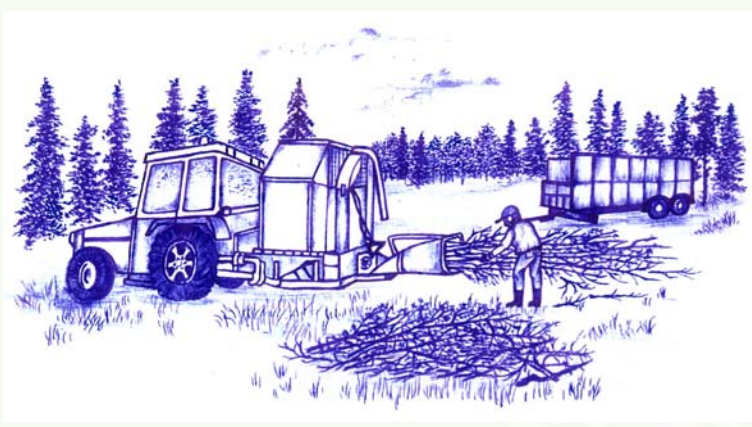
Figure by Katariina Karjalainen