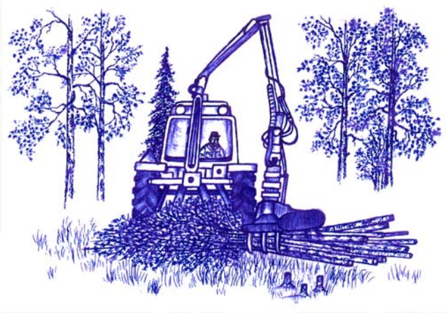
Figure by Katariina Karjalainen