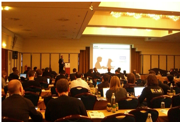
Figure 3: Elies Prunés (ATOS) in the presentation of SOA4All at the Venture Capitalist Seedcamp

The presentations are available through this link: http://videlectures.net/estc2010_vienna/