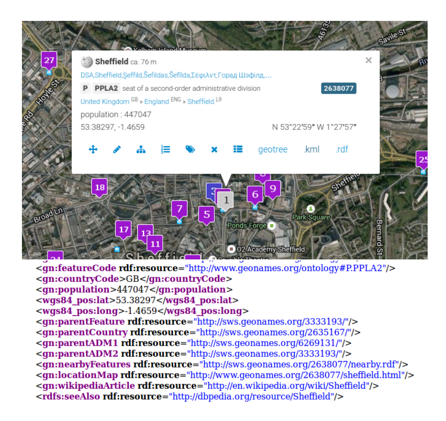
Figure 3.1: Geonames entry and XML for Sheffield. Note the DBpedia link.

Spatial grounding is achieved through three non-DBpedia mechanisms. Firstly, we ground in terms of latitude and longitude if these are available in the social media post's metadata (which accounts for a growing proportion of work; (Sadilek et al., 2012)). Secondly, we use the Geonames linked data resource to connect location mentions to this extensive formal set of conurbations, political regions and geographical features (Figure 3.1). Finally, we map locations into the EU NUTS location space.