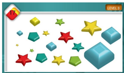
Project partner Imaginary is designing and developing a game-based active ageing environment.

DOREMI is designing and developing a game-based active ageing environment, following all the data collected with the users, during the so-called 'participatory design' and starting from the clinical protocols. This gamified virtual environment will include cognitive games, exergames and a social section. Cognitive games are designed to help people to train and improve cognition. They involve guided repetitive practice on a set of tasks which have been designed to reflect particular cognitive functions such as memory, visuo-spatial skills, attention, language and executive functioning.