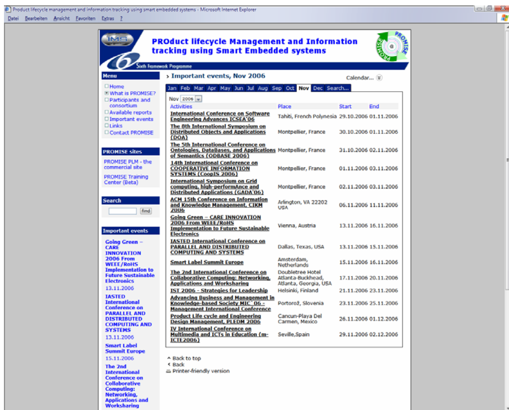
Figure 1: www.promise.no / important events

Among other things the promise.no website provides an overview on the project publications (deliverables, paper, presentations, etc) and events (see also Figure 1) related to the project such as conferences, information days etc.